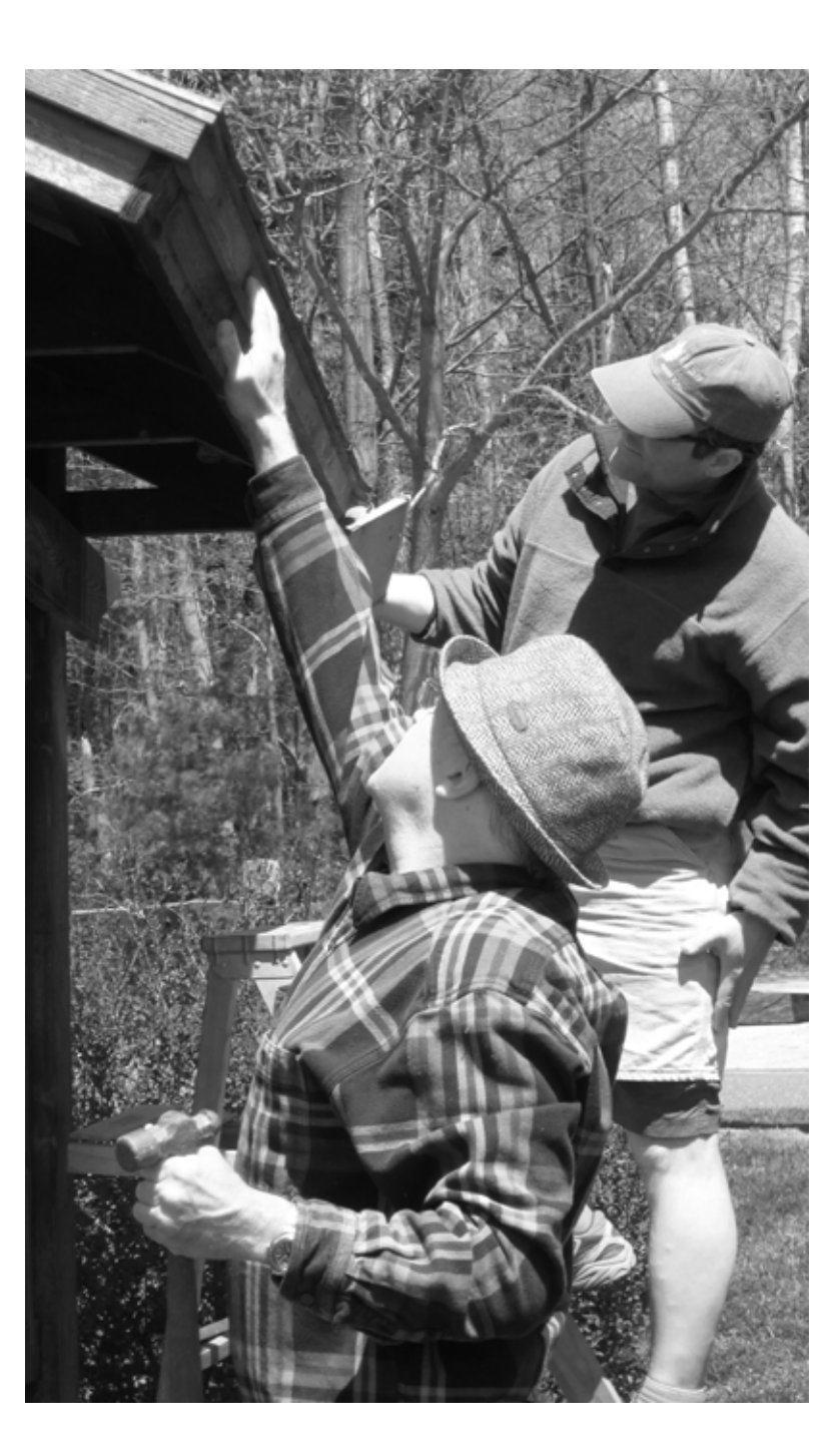
Lake Mansfield Sunday April 28, 2013 Join Us

To access information about Lake Mansfield and learn more about LMA go to our newly developing website: www.lakemansfield.org. LMA is currently seeking community members to serve on its steering committee. Please consider giving your time; contact info@lakemansfield.org and be a part of effective community stewardship.