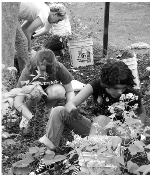
Simon's Rock volunteers weed the river bank

We look forward to another year of walking along the trail, observing new growth of our "native-native" plantings and sharing the beauty of the riverbank with the community. We are ever grateful to our donors and volunteers. Learn more at www.gbriverwalk.org