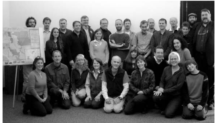
GB Trails partners gathered at Berkshire South Regional Community Center

GBLC is dedicated to preserving and enhancing the community's natural resources and distinctive character. Through promotion and fund-raising endeavors, GBLC enables the dedication of open space to agricultural, recreational and scenic purposes through acquisitions, conservation easement and agricultural preservation restrictions.