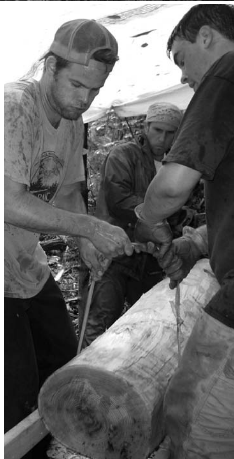
Locust logs are milled on site

The conservation forest trail project is an great example of the important work that LMA continues to do on behalf of open space, recreation, and community health. Improving the trails in the conservation forest