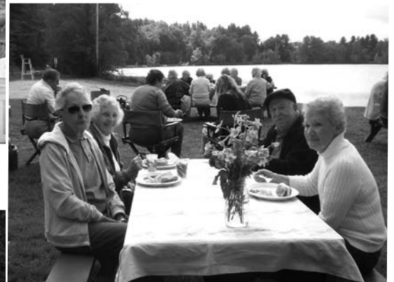
Senior Picnic Day drew a wonderful turn out

After the planting, tables were "clothed" and bedecked with flowers,