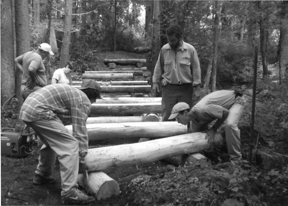
Volunteers place bridge footings