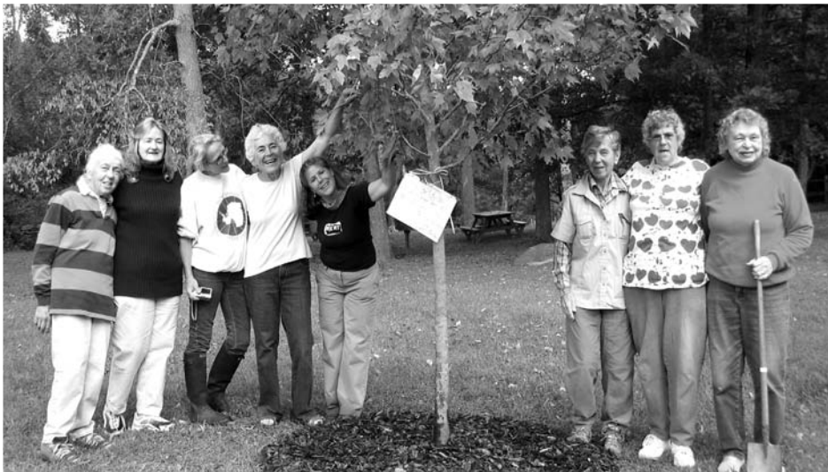
Proud tree planters around a new red maple donated by LMA and the GB Garden Club

of Public Works and the Parks and Recreation Commission. Planning, fence materials and volunteer labor were provided through LMA.