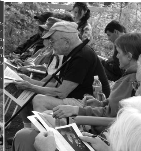
Exotic invasive plants workshop