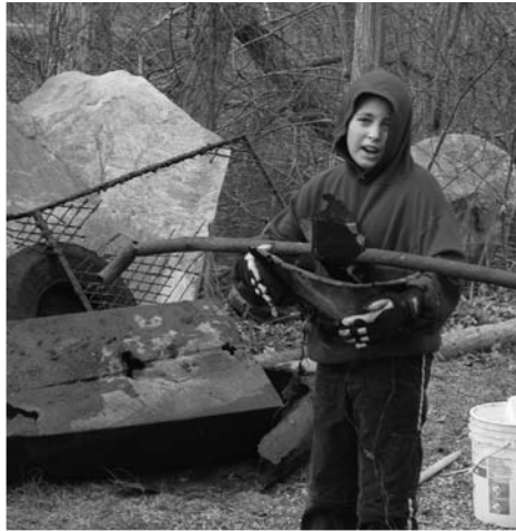
A hard working volunteer at the Lake Clean-up

LMA and the Lake Mansfield Improvement Task Force (a town appointed group) spearheaded two important safety measures at the lake's beach and parking areas in response to community concern. A split rail fence and raised crosswalk were installed in cooperation with the Great Barrington Department