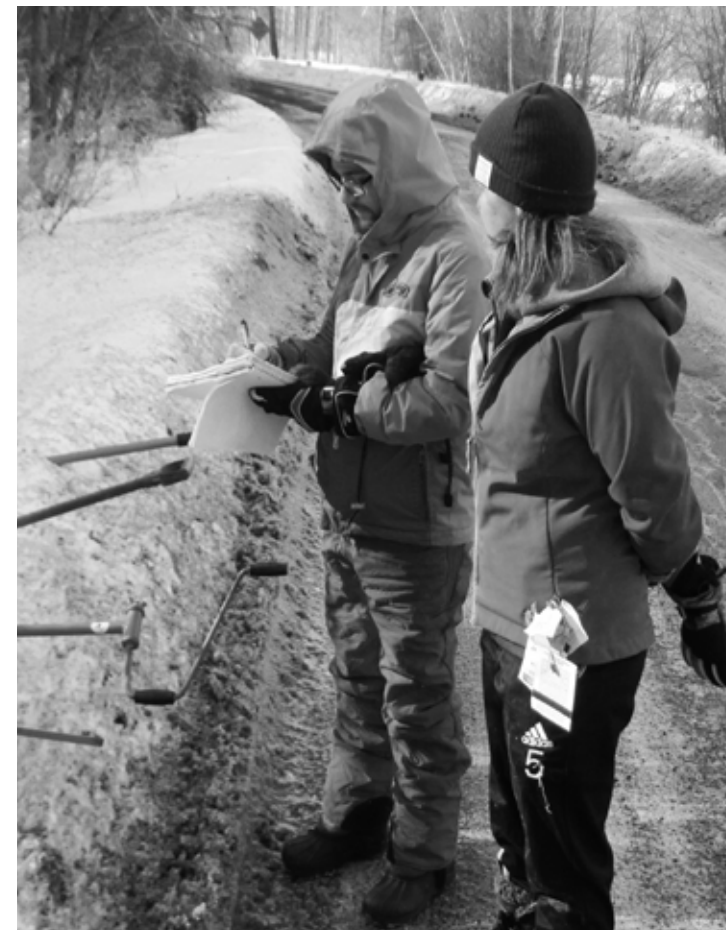
Students participate in 2 year WaterQuality testing.

usable water quality data. Simon's Rock students conduct the field work and research in classes and through internships under the technical and scientific direction of BERC, a nonprofit organization at the college that provides research opportunities for its undergraduates. The Town provides administrative oversight. Simon's Rock provides the use of laboratories, supplies, field equipment. And LMA provides outreach and publicity to the community.