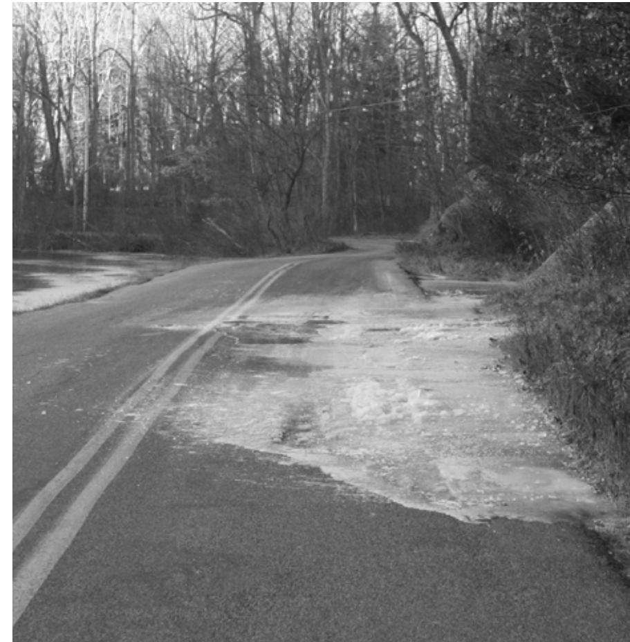
Annual freezing and thawing = safety concerns and road deterioration.

on May 21, 2014. Attending were representatives of the Conservation Commission, Planning Board, Select Board and Parks Commission, and the Town Planner. To clarify the special permitting required and to help inform possible solutions, the Department of Environmental Protection circuit rider and a Berkshire Regional Planning Commission Senior Planner were also present. The site visit resulted in a heightened awareness of the complexities of repair and necessity of a comprehensive and coordinated approach. Several layers of protection must be considered before any option can be selected. All work, except routine paving, will require review by the Conservation Commission, Natural Heritage and Endangered Species, and Army Corps of Engineers. The feasibility and cost of proposed options are directly related to environmental impact and permitting requirements. Solutions for the LM Recreation Area must also support recreational use, public safety and community access.