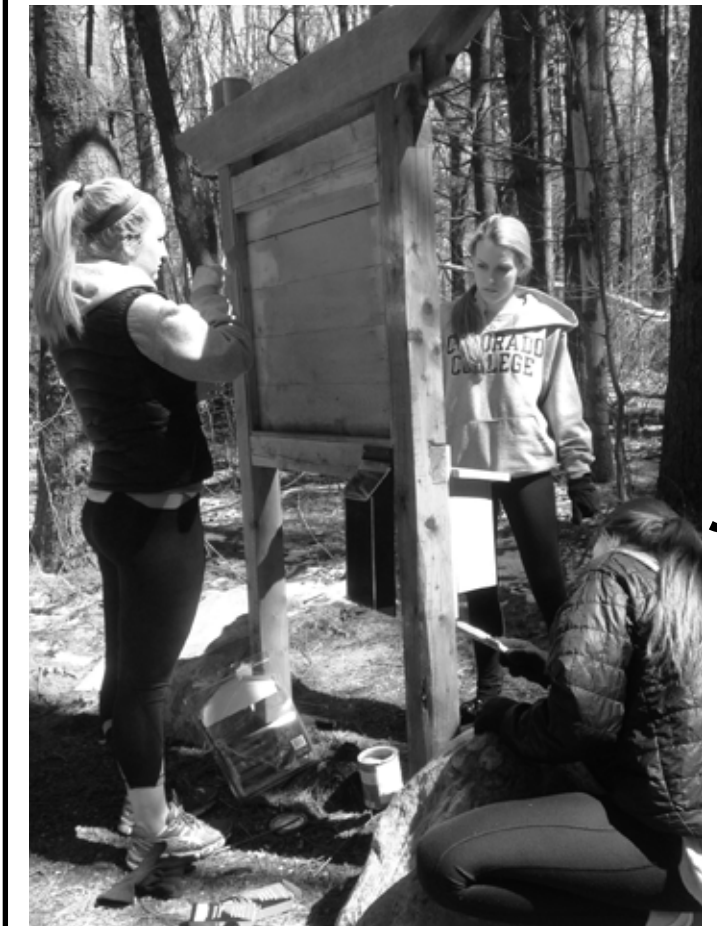
Berkshire School students spruce up trail kiosks.

Enjoy! The lake and forest offer beauty, recreation, connection, and inspiration. Go alone, bring a friend, walk, run, swim, fish, paddle or just sit! This community space is here for all. www.lakemansfield.org