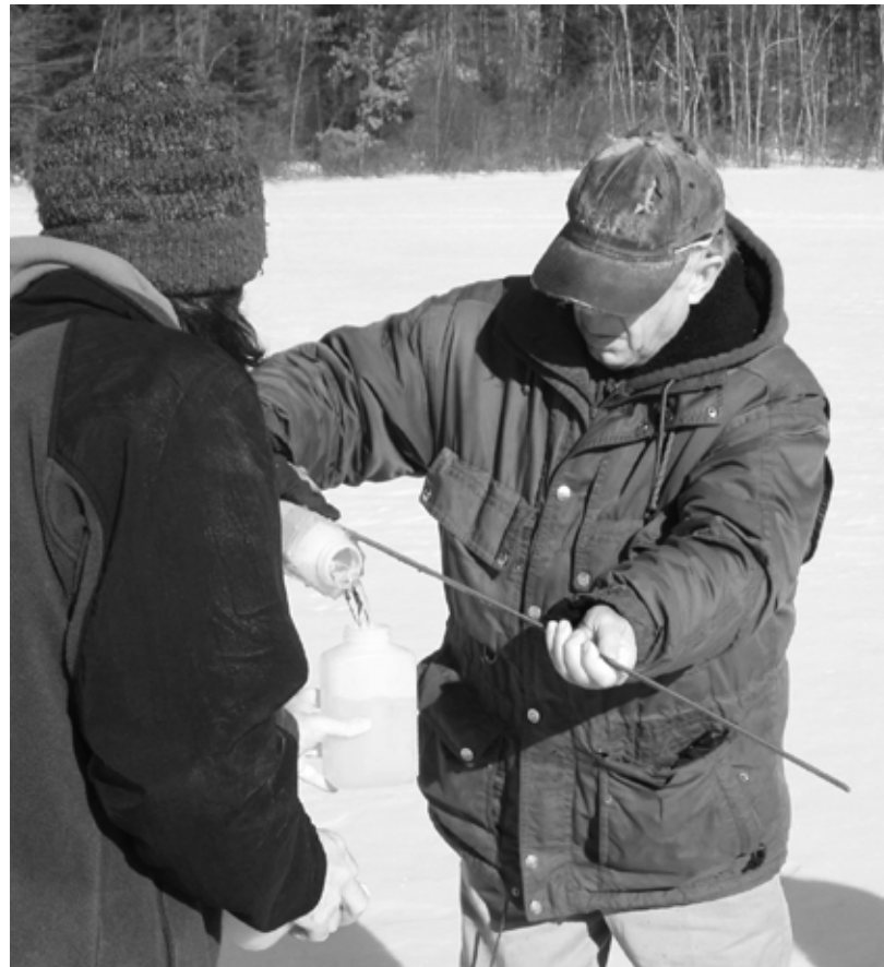
Samples are collected at several lake sites.