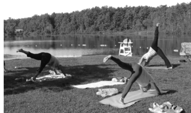
Drop by for yoga – all levels welcome.