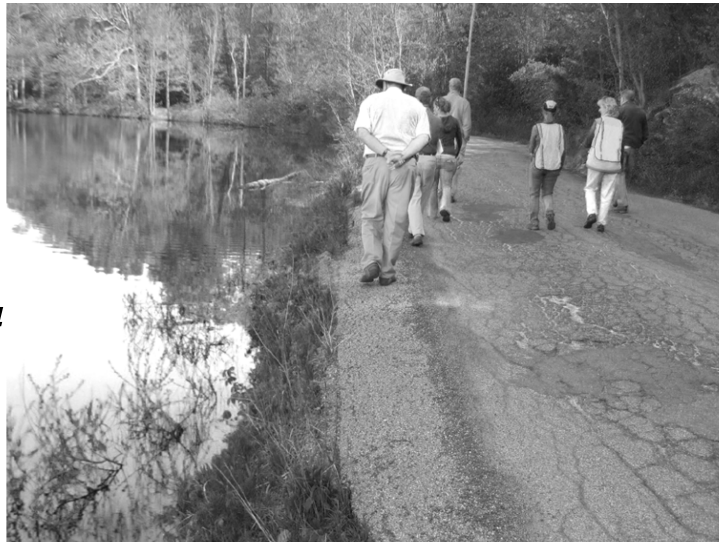
Improvement options weighed at spring 2014 site visit.

In an effort to clearly understand the options provided by Tighe and Bond, the Task Force hosted a site visit