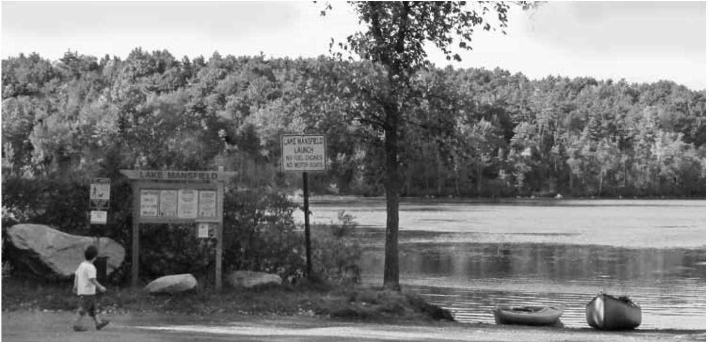
New sign kiosk built and installed by LMA members this year at the boat launch

Lake Mansfield now belongs to all the residents of Great Barrington. In May 2007, voters at Town Meeting voted to accept Lake Mansfield from the Prudential Committee of the Great Barrington Fire District. This past year the lake was surveyed and the lake was officially transferred to the Town of Great Barrington with the filing of a deed. Now that we (all the town's people) own the lake, it is our responsibility to care for and protect it.