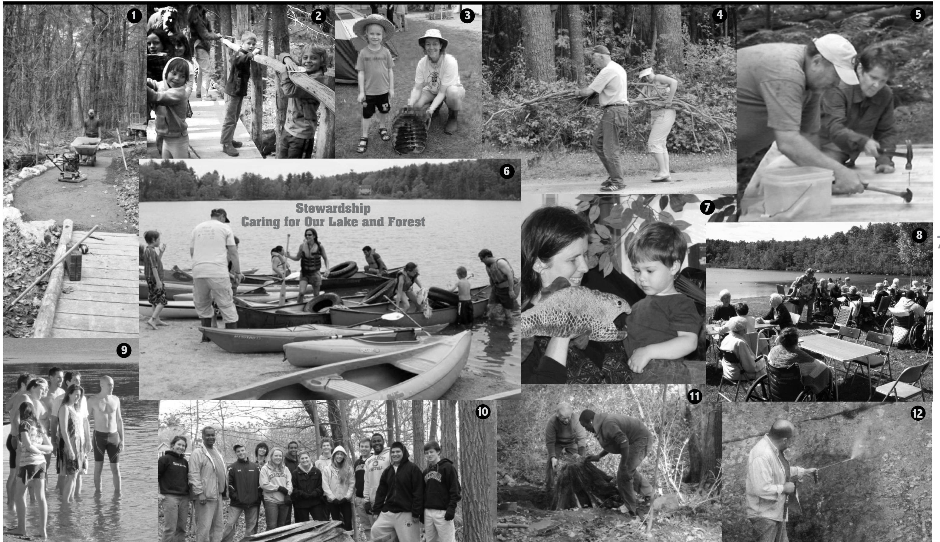
1. Jensen Trail Contractors provide world-class trail construction 2. Elementary students from the Mountain Road School have adopted our LM trails 3. An amazing snapping turtle shell discovered at Lake Day 4. Lake Day volunteers attack invasive bittersweet 5. Trail Volunteers work to complete the Bridge & Boardwalk 6. Lake Day Canoes & Kayaks are donated by PJ Hunt & Berkshire South 7. Youngsters learn about protecting the watershed at an educational program funded by LMA, the GB Cultural Council and GB Garden Club 8. LMA helps host the Elderberry Bash 9. Cross Lake Swimmers have a great time & support LMA 10. Berkshire School Students work on LM Trails 11. Valiant trail builders battle a stubborn stump 12. People Power! LMA volunteer takes initiative in cleaning graffiti from whale rock