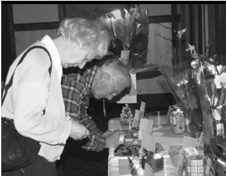
Thank you to all who contribute to our Lake Mansfield Cabin Fever Fundraising Event